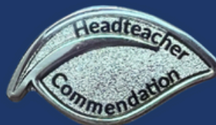
Silver Award Awarded 2nd time