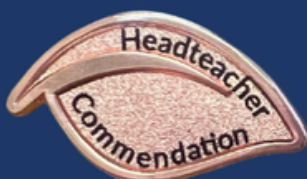
Bronze Award Awarded 1st time

Ambition - for high aspirations (mock) exam results, assessment results