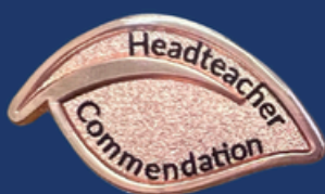
Bronze Award Awarded 1st time

Ambition - for high aspirations (mock) exam results, assessment results