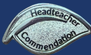
Silver Award Awarded 2nd time